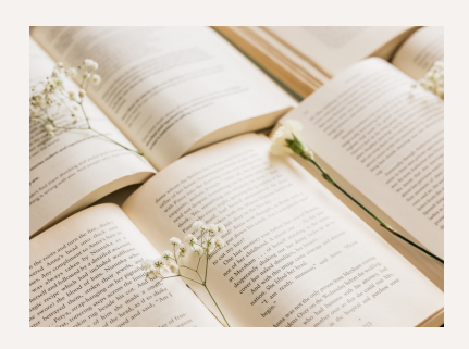
ARE WILLING TO DO THE UNCOMFORTABLE WORK

A Parradiigm Mastercoach™ is someone who puts their own development at the forefront for their craft for their clients' sake.