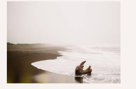
HAVE UPLEVELED THEIR COACHING SKILLS

Through learning, relearning and receiving feedback for further development for their clients sake.