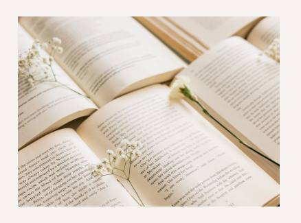
ARE WILLING TO DO THE UNCOMFORTABLE WORK

A Parradiigm Mastercoach™ is someone who puts their own development at the forefront for their craft for their clients' sake.